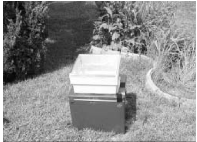
The author's solar oven

He built the dehydrator and sent it to me to test out. After waiting a few days for a sunny day, I put zucchini slices on the trays to see how it would work. I tried a chopped onion a few days later.