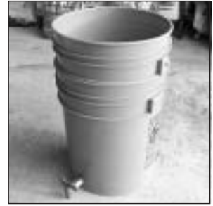
Place bucket #1 into bucket #2. An airtight lid must be used with bucket #1 and removed only when kitchen waste is added. I use gamma seal lids.