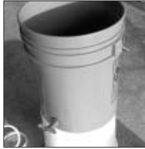
Add a spigot no more than 1.5" from the bottom of bucket #2. See the barrel tap spigot at www.usplastic.com . I snip off part of the nozzle.