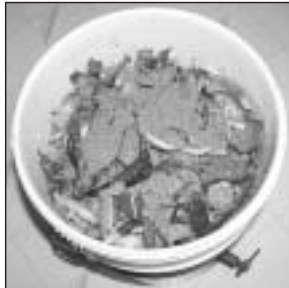
Add kitchen waste and cover each layer with a handful of bokashi until the bucket is full.