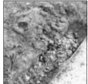
After about 10 days of fermenting, your compost can be buried in your yard or garden.