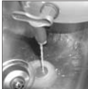
While the waste is fermenting, liquids will seep through the holes in the bottom of bucket #1. The liquids must be drained from bucket #2 as needed.