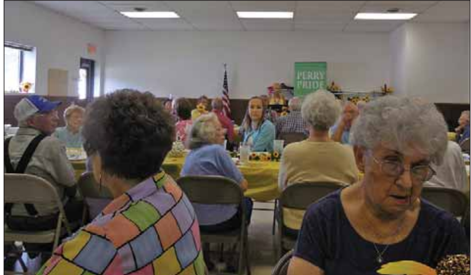
The Perry Senior Citizens’ monthly luncheons usually attract a crowd of 60 happy and hungry people.