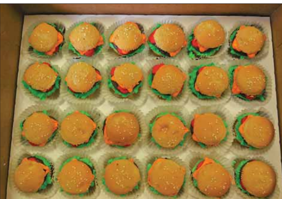
Cheeseburger cupcakes: They may look like cheeseburgers, but they are actually delicious cupcakes created by Suzy Bee Bakery courtesy of First State Bank & Trust.